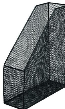
Metal Magazine Stand